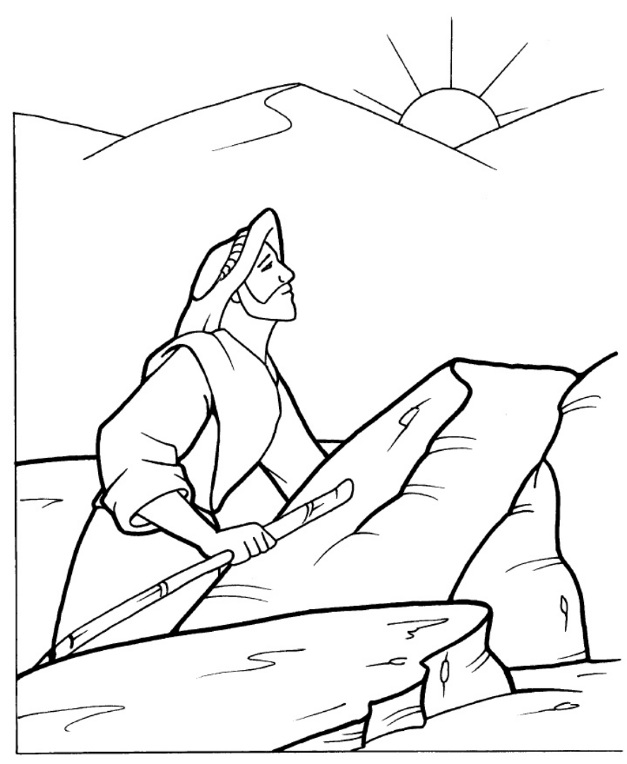
The Temptation of Jesus

Then Jesus was led by the Spirit into the desert to be tempted by the devil. Matthew 4:1 (NIV)