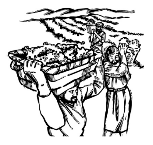
Copyright © Sermons4Kids, Inc. May be reproduced for Ministry Use